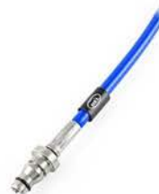
HEL flexible braided clutch line for Ford Focus MK3 RS and ST right hand drive (2013-2018) Part No. CCK157