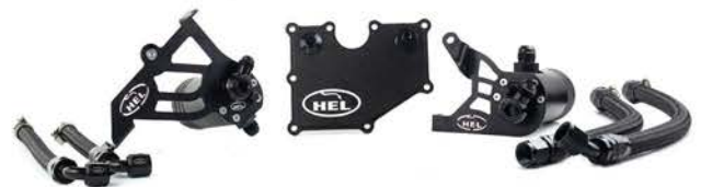
HEL dual oil catch can kit Part No. MK3RSDCCK