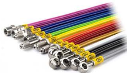
HEL braided brake lines Part No. FOR-4-686